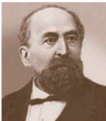
Figure 23. Peter Tchikhatcheff; litmir.net. Figura 23. Peter Tchikhatcheff; litmir.net.