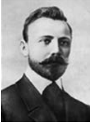
Figure 19. VI. Russanov; Moscou-Leningrad, 1945. Figura 19. VI. Russanov; Moscou-Leningrad, 1945.