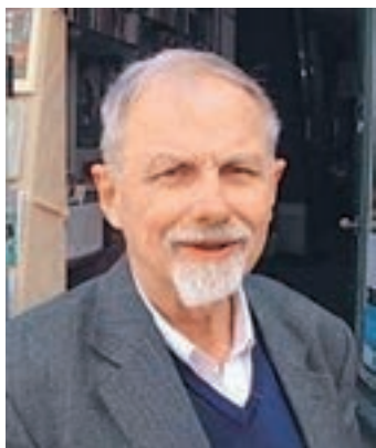
Figure 7. N. Grekoff; seraphin.typepad.fr. Figura 7. N. Grekoff; seraphin.typepad.fr.