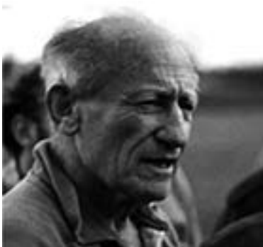
Figure 22. Haroun Tazieff; www.babelio.com . Figura 22. Haroun Tazieff; www.babelio.com .