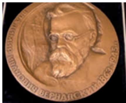
Figure 25. Vladimir Vernadsky; photo P.Tchoumatchenco. Figura 25. Vladimir Vernadsky; foto P.Tchoumatchenco.