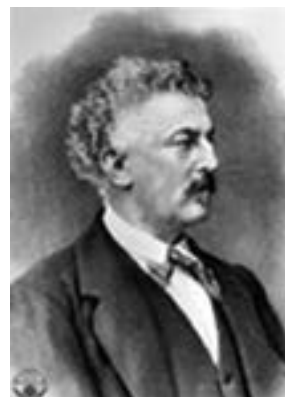
Figure 24. Plato Tchikhatchev; liveinternet.ru. Figura 24. Plato Tchikhatchev; liveinternet.ru.

articles totaling over 10 000 pages. In the 1850s, Peter Tchikhatcheff also made expeditions to eastern Asia (Mnouchine L. et al. , 2008; Tchoumatchenco P. et al. , 2014). One of the great Altai mountain ranges is called the Tchikhatcheff Ridge. His name is also given to a bay in the Sea of Japan. He lived mainly in France, publishing mostly in German and French, and died in Italy.