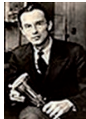
Figure 20. S. Scherbatskoy; invention.smithsonian.org. Figura 20. S. Scherbatskoy; invention.smithsonian.org.

SERGE SCHERBATSKOY / Сергей Александрович Щербатской (* 1908, Buyuk Dere, near Constantinople, Turkey - † 2002, Paris, France)(Fig. 20), geophysicist and petroleum geologist, Dr. Serge Scherbatskoy was very talented, being fluent in languages (French, English, German and Russian), and the holder of a Physics doctorate at the Sorbonne (Mnouchine L. et al. , 2008; Tchoumatchenco P. et al. , 2014). In 1929, just months before the great depression, Serge Scherbatskoy moved to the United States. There he patented more than 200 technical inventions for oil exploration, production, and the development of geophysics in boreholes. Serge Scherbatskoy died at the age of 94.